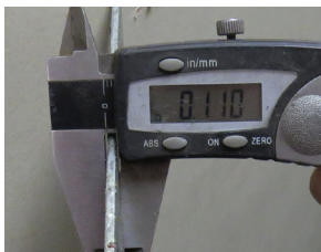
Our Steel Exceeds The Minimum Gauge Requirements!